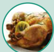
Chicken and turkey