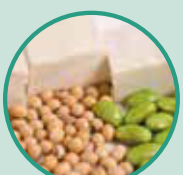
Legumes (beans, tofu)